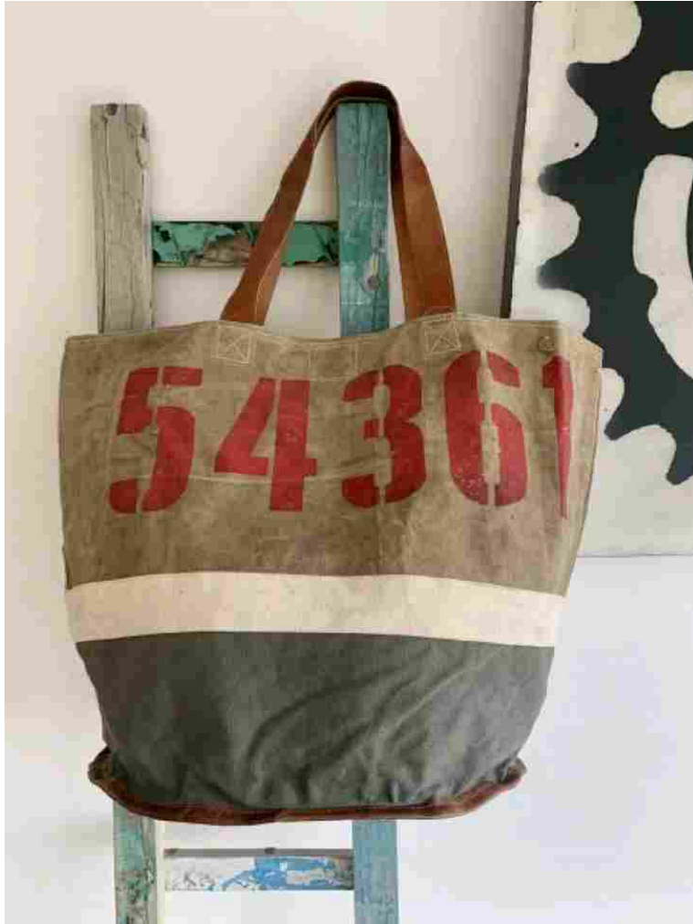
Casa Natura from HOMI Fashion&Jewels Community

detail becomes a differentiating factor and, above all, proves to be a winner for the growth of the company and its brand awareness.