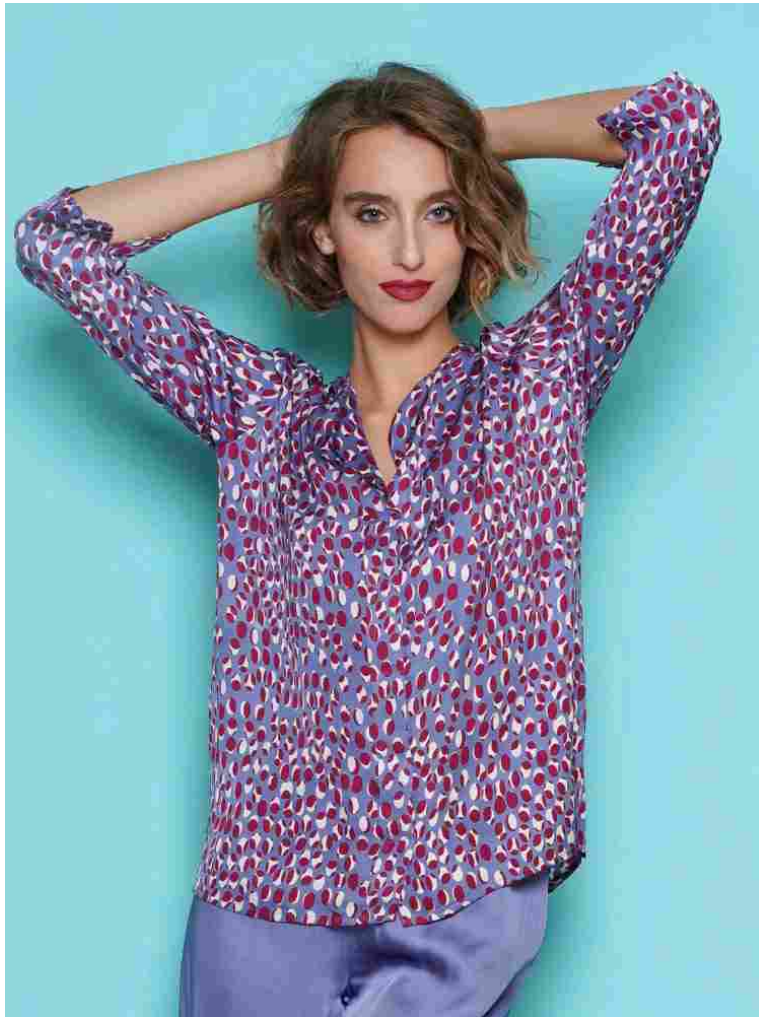
Fusioni from HOMI Fashion&Jewels Community

HOMI Fashion & Jewels Exhibition thus becomes the manifesto of a whimsical, necessary and contemporary sustainability, expanding its proposal more and more and proposing itself as a real hub attentive to the environment with concrete and real answers to an urgent need.