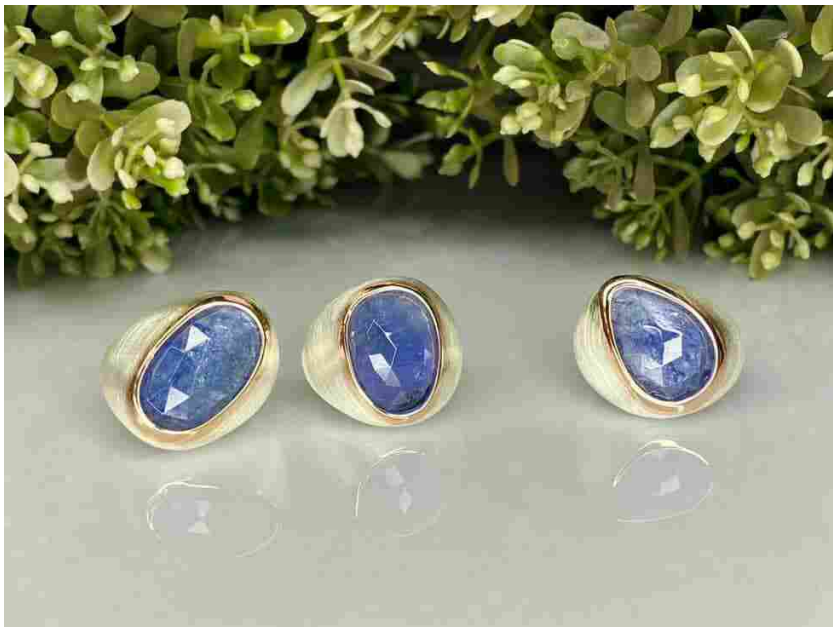
New Art Milano