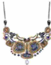
AYALA BAR by AIBIJO