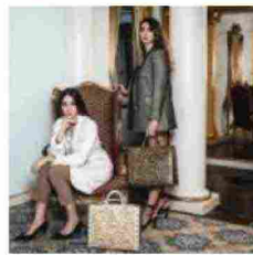
Oro Barocco Amnia bags