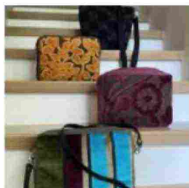
VELVET BAG - MANDULIS