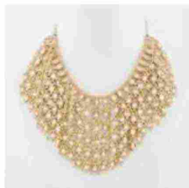
HOUSE OF TUHINA by AIBIJOUX