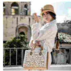
Oro Barocco Amnia bag

Wonders to give and receive as a gift in a preview of what will be the lively edition of HOMI Fashion&Jewels Exhibition, scheduled at Fieramilano (Rho), from 17 to 20 February 2023 that will take place almost simultaneously – from 19 to 22 February – with MICAM Milano , the International Footwear Exhibition, MIPEL International Leather Goods and Fashion Accessory Exhibition, TheOneMilano , International Exhibition of Outerwear and Haute-à-porter.