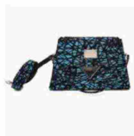
ILA BAG - Rita Cordini

The Christmas story, resplendent with light and craftsmanship, is also encapsulated in the fashion accessories designed to celebrate an unforgettable moment of full Italian creativity, full of ancient wisdom, workmanship handed down over time, and sustainability. Unashamedly Mediterranean are the creations by Ammia that offer bags able to aesthetically translate the essence of Sicily, Rita Cordini 's one-piece bags, created from exclusive fabrics of the local tradition and Mandulis ' bags where leather combines with textures for a strongly evocative result.